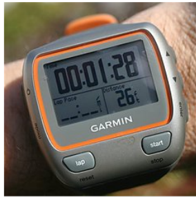
In this photo made Thursday, Oct. 29, 2009, a Garmin Forerunner 310XT is shown in New York.

Digg submit Facebook Twitter Reddit StumbleUpon More